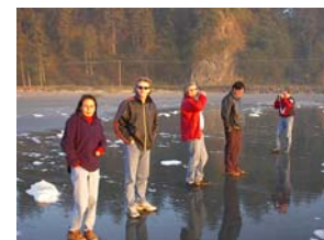
Staff stroll the beach at Neah Bay, WA during a staff retreat.

“This is exactly what our people need. How do we get this to our people back home?”