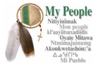
The My People international logo.

The two feathers represent cultural encounter, which is at the heart of ministry in a good way. Ministry is reciprocal. Each person in the encounter has both something to offer another and something they need from the other. All creation—including people of differing cultures and