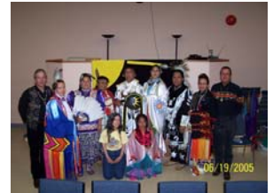
Dancing The Way completed its fifth summer tour of ministry to reservations and churches June 12-22.